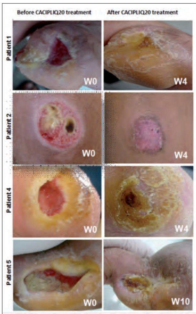
Figure 3: Wounds before and after CACIPLIQ20® treatment from patient 1, 2, 4 and 5

After the 10-week study, the patients received no further CACIPLIQ20® therapy leaving the 4 patients with persistent wounds at 10 weeks to standard care. After 6 months, in patient 7 the wound was fully healed. In the other 3 patients, no change in wound healing was noted compared to study completion. Moreover, no recurrence was observed after 6 and 9 months in the 6 patients with completely healed wounds. This in spite of their return to normal activity with well-tolerated weight bearing.