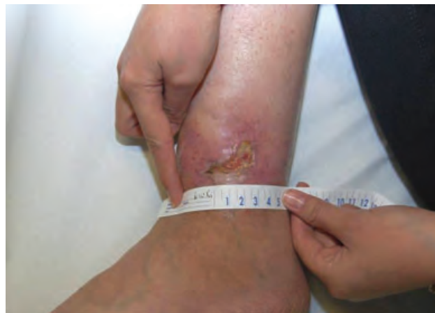
Figure 2 The patient's ulcer 3 weeks after the first application of Caciqliq20 ® .