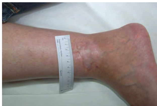
Figure 3 The patient's ulcer 8 weeks after the first application of Caciqliq20 ® .