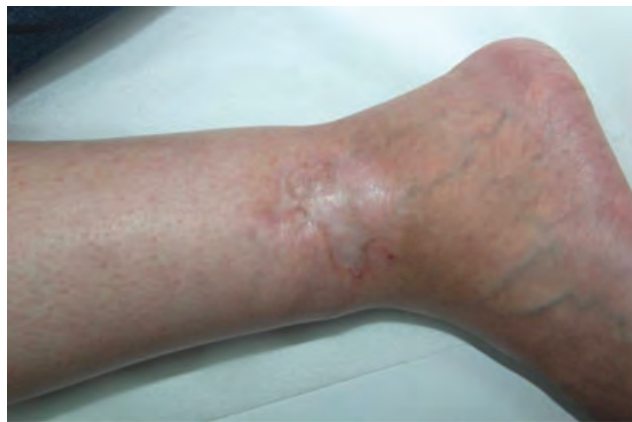
Figure 4 The patient's ulcer 12 months after the wound has healed completely.

repair in rats (27). One of the approaches to treat chronic non-healing wounds is to replace the GAGs in the extracellular matrix in order to restore tissue homeostasis and to protect the wound from further damage (28). Caciqliq20 ® is a skin specific synthetic bioengineered heparan sulphate GAG mimetic which replaces the heparan sulphate that was destroyed in the wound, restoring the extracellular matrix scaffold and allowing key interactions with growth factors to occur (28). Moreover, synthetic heparan sulphate mimetic is resistant to destruction by endoglycosidase, making it efficient in restoring the extracellular matrix by binding to heparan-binding sites that become available when the endogenous heparan sulphate is destroyed by heparanase activation (28–30).